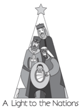
A Light to the Nations